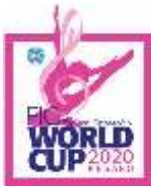
FIG RHYTHMIC GYMNASTICS WORLD CUP PESARO (ITA) 03 – 05 APRIL 2020 INDIVIDUAL AND GROUP